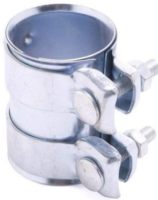
Universal Exhaust Pipe Sleeve Clamp

The overall length of the exhaust centre pipe must not be altered. You may either use a Universal Exhaust Pipe Sleeve Clamp as shown below or make a slip joint.