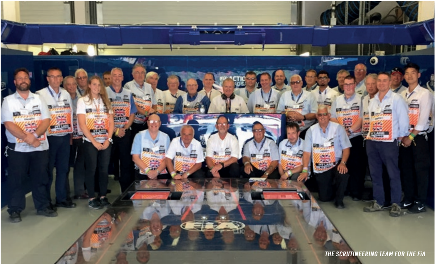
THE SCRUTINEERING TEAM FOR THE FIA